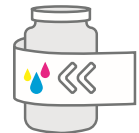
Print & Apply