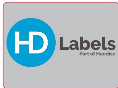
Finished label trimmed to size